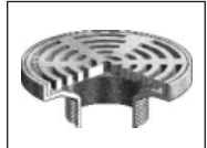
F1320-TA-4 (*) (*) Denotes Strainer Finish (-1, -3 or -4)