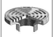
F1320-TA-4 (*) (*) Denotes Strainer Finish (-1, -3 or -4)