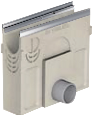
T1500-CB620-13 Galvanized Edge

MIFAB®'s T1500-CB620 Catch Basin shall be 19.7”(500mm) long with a 4” (100mm) internal width. The catch basin 23.6” deep. It is available with a 4” or 6” outlet. A sediment bucket is included with every basin. The catch basin is made from High Strength Polymer Concrete. Each channel comes with a Galvanized edge rail or Stainless steel edge rail. The catch basins achieve Load Class A-E depending on the grate utilized. T1500-CB620-4 is only Class F.