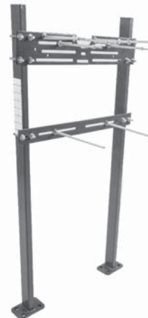
MC-41 &amp; MC-42 with cast ductile iron arms.