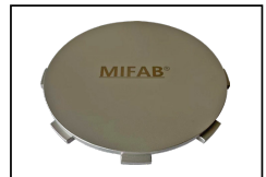
-PD Special duty solid cover with perimeter drain gap