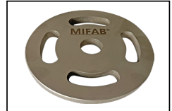
-RS Special duty slotted grate with finger holes