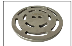
-RS Heavy duty slotted grate with finger holes