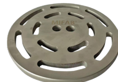
-RS Special duty round slotted grate with finger holes (Grate part # - P3230-PG-RS)