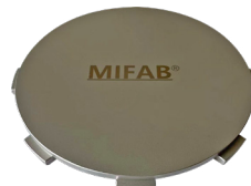
-PD Special duty solid cover with perimeter drain gap (Grate part # - P3230-PG-PD)