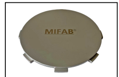
-PD Heavy duty solid cover with perimeter drain gap