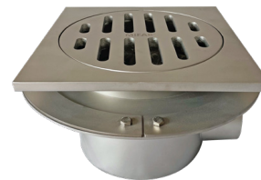
Optional -90 side outlet (with non-adjustable top)

Product is currently not available, contact MIFAB for alternative solutions