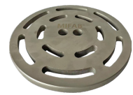
-RS Heavy duty slotted grate with finger holes

Product is currently not available, contact MIFAB for alternative solutions