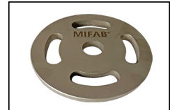
-RS Heavy duty slotted grate with finger holes