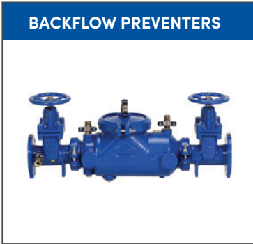
BACKFLOW PREVENTERS BEECO - BACKFLOW PREVENTERS Backflows, PRVs, strainers, gauges, gate valves, ACVs and dielectric unions.