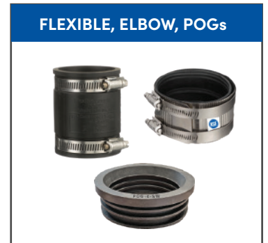
FLEXIBLE, ELBOW, POGs

Available in satin coated steel and stainless steel. Custom sizes available upon request.