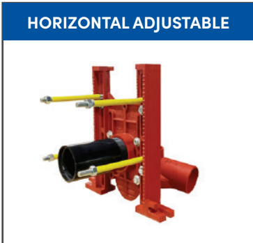
HORIZONTAL ADJUSTABLE FIXTURE CARRIERS Horizontal, vertical and adjustable fixture carriers available.