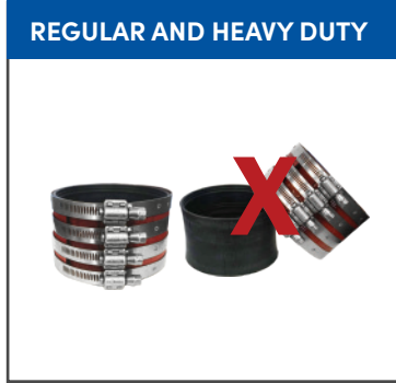
REGULAR AND HEAVY DUTY QUICK HUB NO HUB COUPLINGS Different from regular couplings. With Quick Hub there is no need to remove gasket, simply place on pipe.