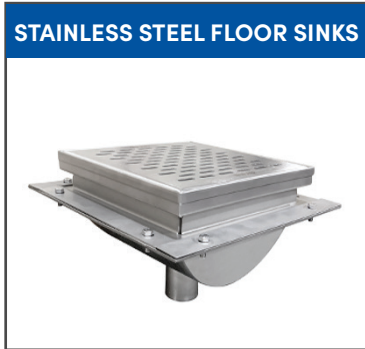
STAINLESS STEEL FLOOR SINKS

Made of Type 304 stainless steel to make cleaning, maintenance and installation easy.