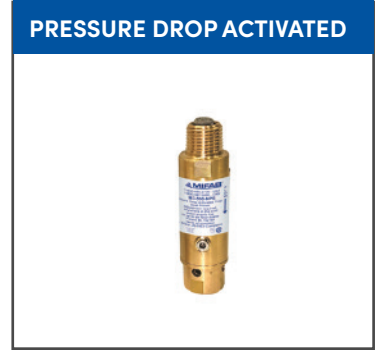
PRESSURE DROP ACTIVATED TRAP SEAL PRIMERS Pressure drop activated, electronic and more.