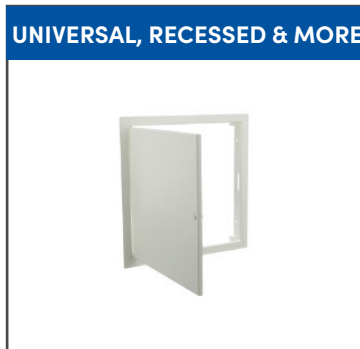
UNIVERSAL, RECESSED & MORE

Custom steel and stainless steel fabrication available to meet your needs