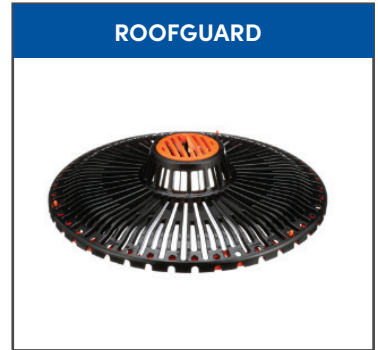
ROOFGUARD PLASTIC AND CAST IRON ROOF DOMES Eliminate standing water and increase surface area by 5x - making drains uncloggable.