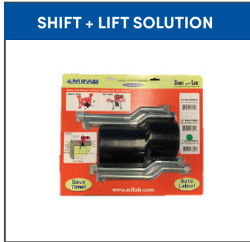
SHIFT + LIFT SOLUTION UNIVERSAL WATER CLOSET OFFSET CARRIER KIT You can now offset the fixture without having to tear out the wall and carrier, with our Shift + Lift solution.