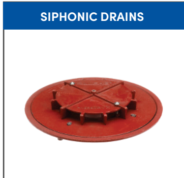
SIPHONIC DRAINS HYDROMAX SIPHONIC DRAINAGE Use smaller pipes and fewer drains with siphonic drainage. Pipe runs flat!