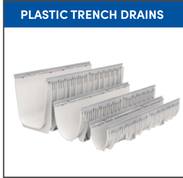
PLASTIC TRENCH DRAINS

High-performance channels combined with a light polymer concrete and a reinforced design in a range of loading classes.