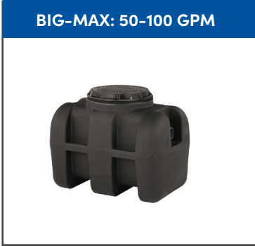
BIG-MAX: 50-100 GPM HDPE INTERCEPTORS Grease, oil, solids/sediment interceptors. 7-250 GPM sizes. LIL-MAX and gravity SUPER-MAX also available (500-2,000 gallons).

Fixture Carriers Cleanouts Acid Neutralization Tanks Water Hammer Arrestors Dialysis Boxes C-PORT (Roof Top Pipe Supports)