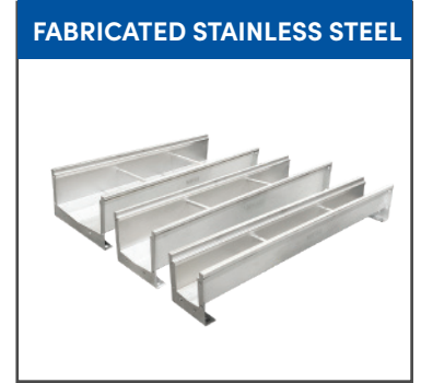
FABRICATED STAINLESS STEEL

More durable than traditional plastic and weighs 75% less than polymer concrete equivalents.