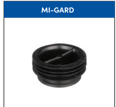
MI-GARD FLOOR DRAIN TRAP SEALS Prevents odors and sewer gases from coming through drains.