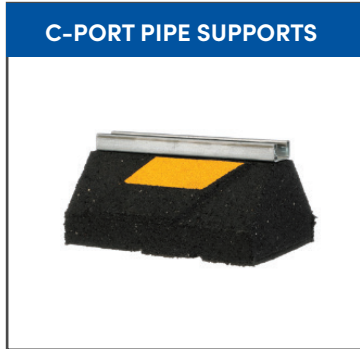
C-PORT PIPE SUPPORTS

Available in square, round, PVC and stainless steel.