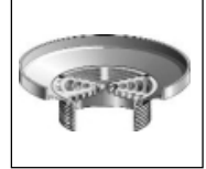
ER-(*) (*) Denotes Strainer Finish (-1, -3 or 50)

F1100-ER Series meets ANSI-ASME floor drain standard A112.6.3-2001