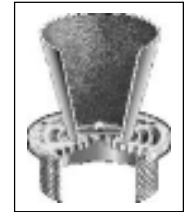
EF- (*) (*) Denotes Strainer Finish (-1, -3 or 50)

F1100-EF Series meets ANSI-ASME floor drain standard A112.6.3-2001