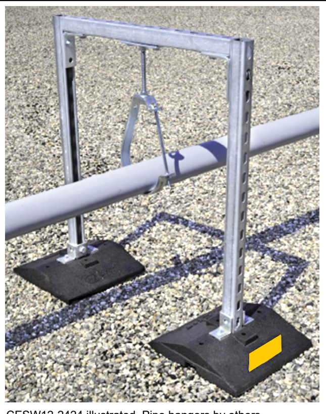
CESW12-2424 illustrated. Pipe hangers by others.