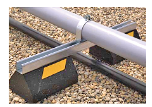
Pipe clamp by others