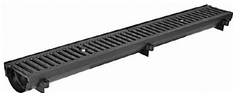
Assembled T300 Trench Drain

Function: Used around pool, residential, multi family, kitchen and sidewalk areas that require surface drainage in shallow (only 2 7/8" deep) excavations. The lightweight and chemical resistant polypropylene body provides for long life. An infinite number of body sections can be assembled together to serve any requirement.