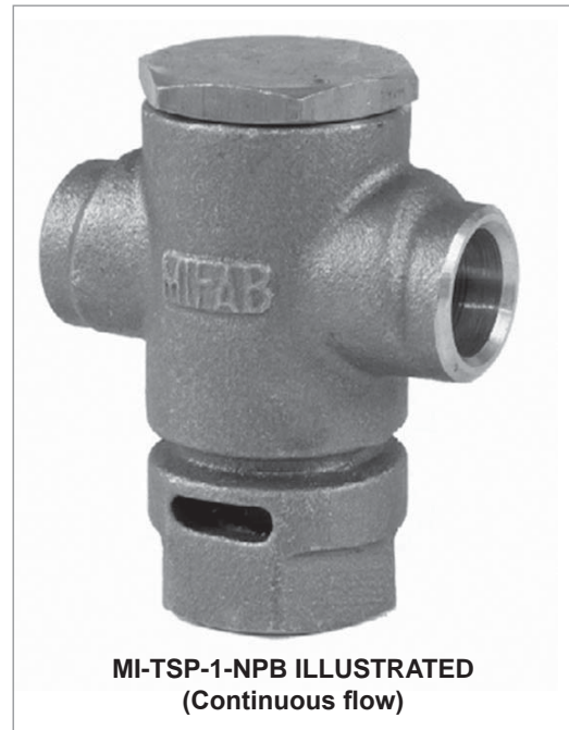
MI-TSP-1-NPB ILLUSTRATED (Continuous flow)