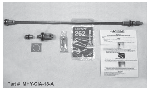
Part # MHY-CIA-18-A

Shut off the hydrant and open the water supply. Test the hydrant for proper function.