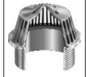
K(-*) (* Denotes Strainer Finish (-1 or -3))

F1100-K Series meets ANSI-ASME floor drain standard A112.6.3-2001