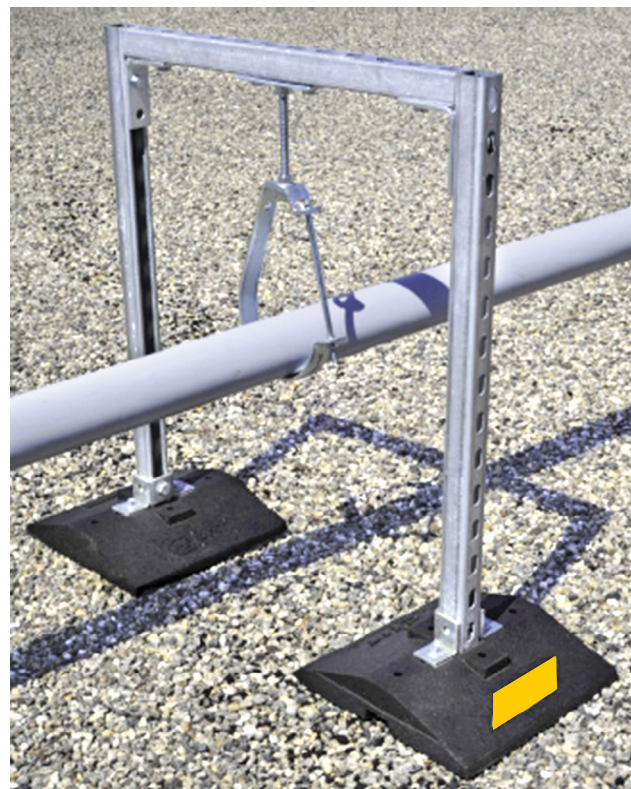
CESW12-2424 illustrated. Pipe hangers by others.